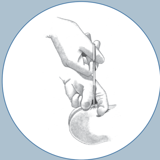
Fig 1: Illustrates the vas clamp encompassing the vas deferens